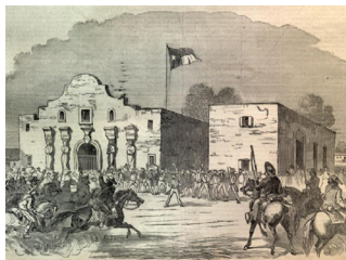
3 Battle of the Alamo