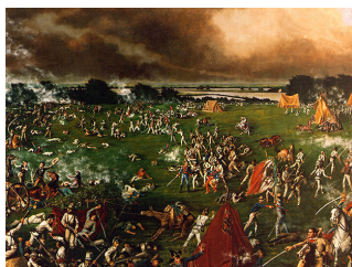
4 Battle of San Jacinto