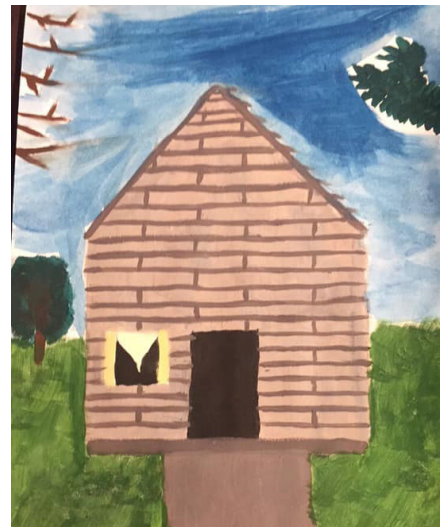
Below is our first entry

First up is a photo of Independence Hall. We can't wait to see your drawings!