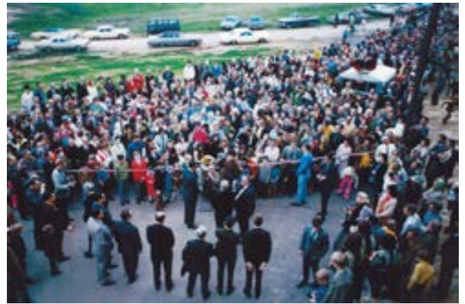
The official opening ceremony on March 1, 1970.