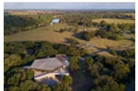
Aerial photo taken in October 2019

Now, as the museum enters its 50th year, it is stronger than ever. Through the new partnership with Blinn College District and the Texas Historical Commission, the museum will be administered by two institutions committed to its success. We look forward to spending the next 50 years telling the story of our Texas forefathers and providing a window into this exciting time in the history of the Lone Star State.